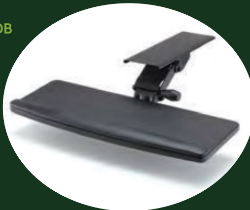
NO KNOB MECHANISM

Steel frame coated keyboard tray with mobility and 360 degree swivel. Height and tilt adjustable with and without knob mechanism. variety of options comes with arm rest and mouse tray.