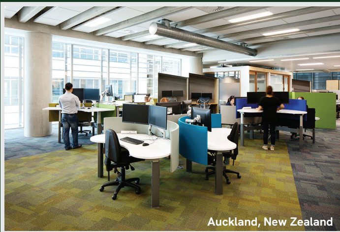
Auckland, New Zealand