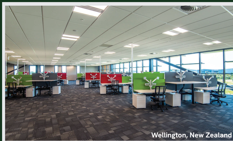
Wellington, New Zealand