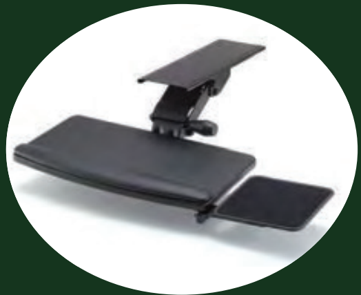
NO KNOB MECHANISM