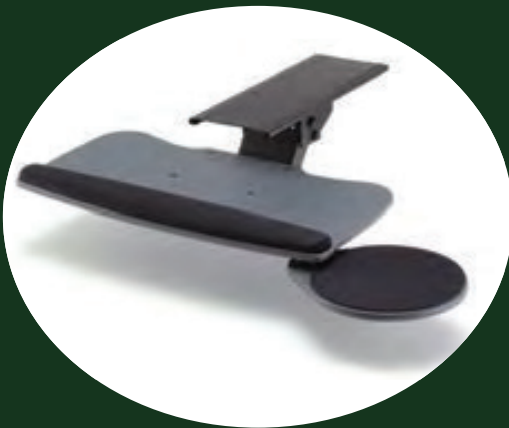
ADJUSTABLE WITH KNOB