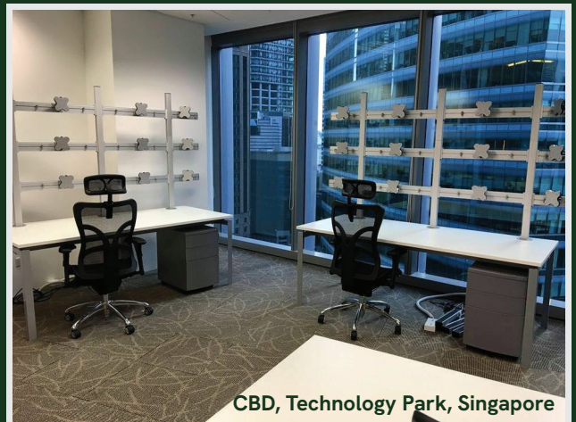
CBD, Technology Park, Singapore