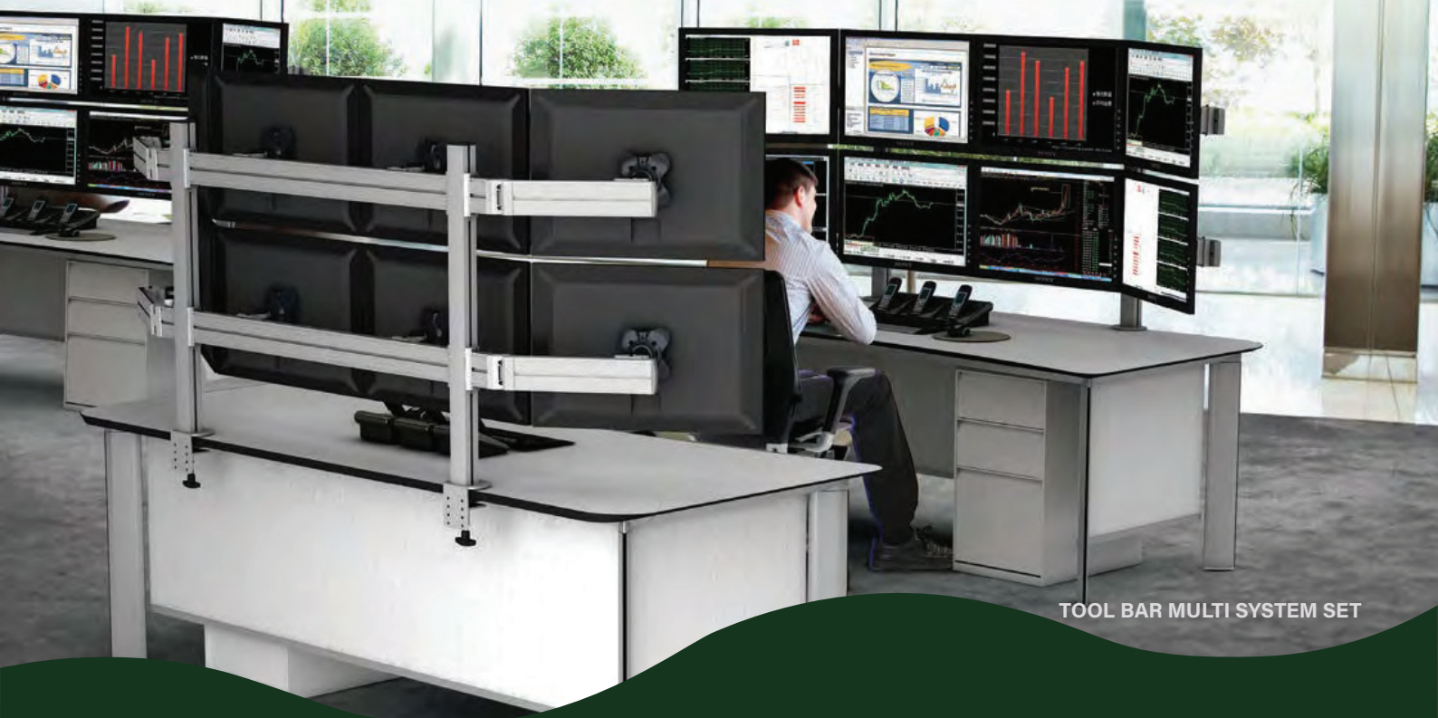
TOOL BAR MULTI SYSTEM SET